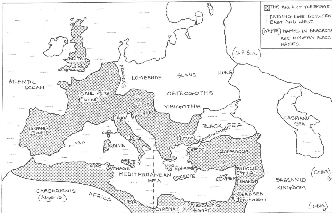
Map of the Roman Empire during St Paul's lifetime

Jewish religion such as the Sadducees, Pharisees, Essenes, and Zealots.