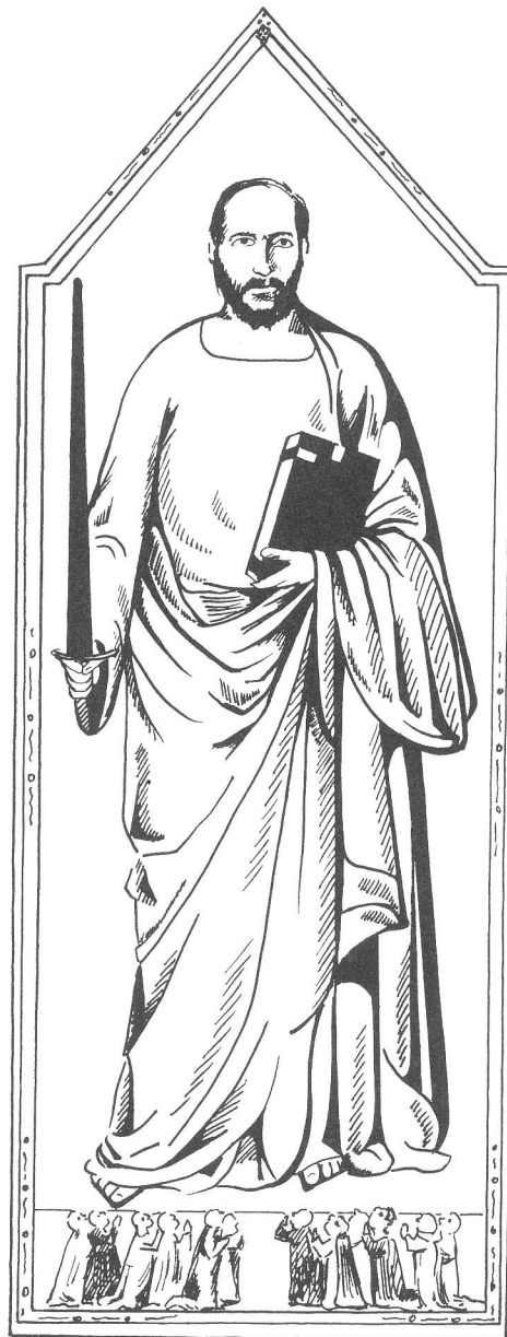
An old Florentine painting of St Paul

Heresy: beliefs and teachings which were