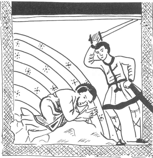
The martyrdom of St Paul

I have been in the deep. In journeyings often, in perils from waters, in perils from robbers, in perils from my own countrymen, in perils from the heathen, in perils in the city, in perils in the wilderness, in perils in the sea, in perils among false brethren. In weariness and painfulness, in watchings often, in hunger and thirst, in fastings often, in cold and nakedness. (II Corinthians 11:24-27)